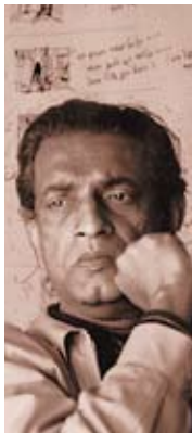
Indian filmmaker Satyajit Ray

Center for Adaptive Optics ♦ Center for Agroecology & Sustainable Food Systems ♦ Center for Global, International and Regional Studies ♦ Center for Information Technology Research in the Interest of Society ♦ Center for Justice, Tolerance, and Community ♦ Center for Molecular Biology of RNA ♦ Chicano/Latino Research Center ♦ Dickens Project ♦ Institute for Humanities Research ♦ Institute of Geophysics and Planetary Physics ♦ Institute of Marine Sciences ♦ Satyajit Ray Film and Study Collection ♦ Santa Cruz Center for International Economics ♦ Santa Cruz Institute for Particle Physics ♦ UC Observatories/Lick Observatory